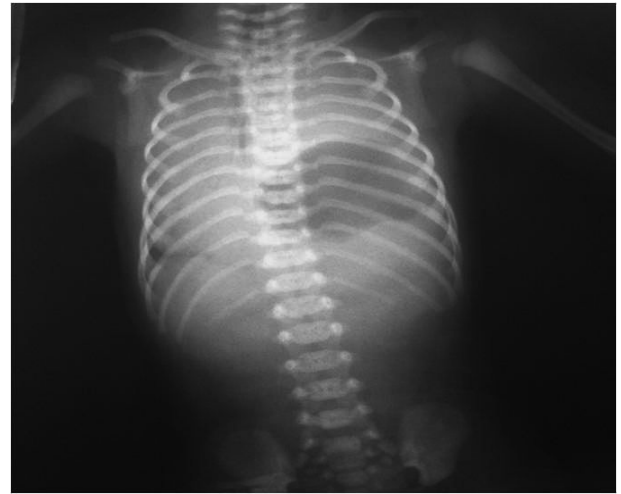
Figure 3: Preoperative chest radiograph

was present in the fetus. At the 36th week, the heart of the fetus was severely deviated to the right. The left lobe of the liver was viewed in the thorax (Figure 2). The fetus had severe growth retardation. The patient was called for weekly visits. The risks were explained to the family on week 39 and cesarean section was performed. The baby had birth asphyxia and was resuscitated with bag and mask ventilation. He was a 2600 grams male fetus with APGAR scores 5 and 4 at the first and fifth minutes, respectively. The patient was kept in the intensive care unit under oxygen and feeds were started. On admission his respiratory rate was 70/min, SpO 2 was 87% while receiving oxygen. Chest X-ray observed in both lungs collapsed (Figure 3).