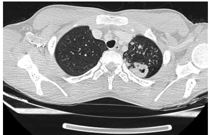
Figure 2: Increased alveolar density and peribronchovascular millimetric size reticulo nodular density increases and ground-glass appearances are observed in favor of Tuberculosis disease in the posterior segment of the superior part of the left lung lower lobe.

Anti-TB drugs were discontinued due to the increase in liver enzyme values on the 7 th day of the patient's re-initiated anti-TB treatment. UDKA was also discontinued because there was no bile duct involvement. The patient's liver enzyme values decreased to normal levels on the following 8 th day. Autoantibodies sent to exclude autoimmune hepatitis were negative. Serum alpha-1 antitrypsin level, ceruloplasmin, and IgG were normal. After the patient's liver enzyme values improved, oral N-acetyl cysteine (NAC) therapy was started on routine 20 mg/kg/day instead of a loading dose in addition to quadruple anti-TB drugs. The patient, who received anti-TB drug therapy for 2 months, received INH, RIF, and oral NAC therapy for another 4 months after 2 months. The patient used NAC treatment orally for 6 months. No toxic hepatitis picture developed again in the regular follow-ups during this period.