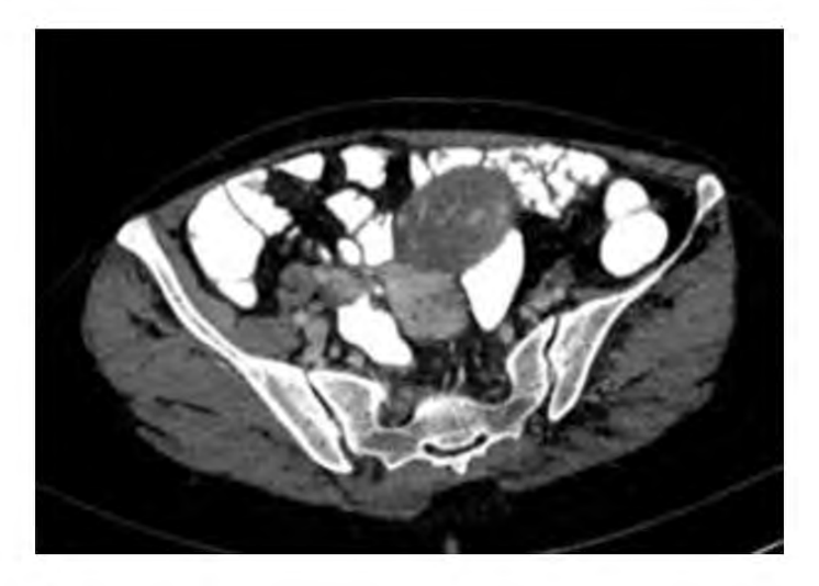
Fig2: A left adnexial solid mass with linear and round densities on CT