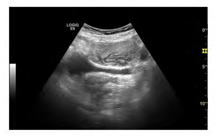
Fig1: A hypoechogenic mass located in the left ovary with central serpentine low reflections on US

A 52- year- old woman who has resided most of her life in rural areas of Anatolia was admitted to the gynecology department complaining abdominopelvic pain and weight loss. The patient had tenderness and palpable adnexial mass on vaginal examination. Ultrasound revealed 7X4 cm hypoechoic heterogeneous mass in the left adnexial region. The ovoid lesion had regular borders with serpentine low reflections (Figure 1). The right ovary, uterus, and other intraabdominal organs were sonographically normal. No free fluid was seen in the pelvis. The laboratory tests revealed NEU 86%; HGB 11.2 g/dl, HCT 31%, EOS 0.1%, and tumor markers were negative. Her chest radiogram was normal. Hydatid disease and adnexial malignancy were differentials. Abdominal demonstrated a mass with solid appearance. The lesion had fine linear round densities showing no enhancement after contrast (Figure 2). MRI revealed a hypointense mass on T1W images, showing hyperintense collapsed membranes as twisted linear structures within the lesion on T2W images. A very thin hypointense rim around the lesion was noted on T2W images which slightly enhanced after contrast (Figure 3). Based on these imaging findings and patient's history of residency, ovarian HD was diagnosed. The patient underwent surgery and pathology confirmed the diagnosis.