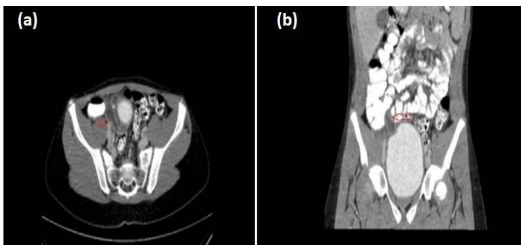
Fig. 2. Preoperative CT scan showing a hypodense cystic formation on the axial (a) and coronal (b) sequences, in dimensions of 40x15 mm in medial of the cecum, with opaque wall (3 mm) following infusion of I.V. contrast agent (appendix mucocele?).