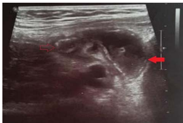
Fig. 1. On the ultrasonographic imaging, appendix vermiformis of which calibration was measured 5.6 mm in the proximal segment (hollow arrow) and 15 mm in the distal segment (solid arrow), with thick wall and edematous, lumen is full of fluid echogenicity, and edematous image of the mesentery.

infusion of I.V. contrast agent, in dimensions of 40x15 mm was observed and that there were hyperdensity of mesenteric adipose tissue nearby cecum (Figure 2). Operation was decided for the patient and intravenous (I.V.) metronidazole 30 mg / kg/day and I.V. Ceftriaxone 75mg/kg/day started administering as prophylactic. A laparoscopic appendectomy was performed by means of linear stapler according to the preliminary diagnoses of appendicitis and mucocele, in a way that the entire appendix tissue will be excised and with excision of 3-4 mm from the cecum wall. As a result of examination of the piece taken out of the abdomen without rupturing it, by frozen section, the operation was terminated because no finding was observed that would suggest mucocele or another malignant condition.