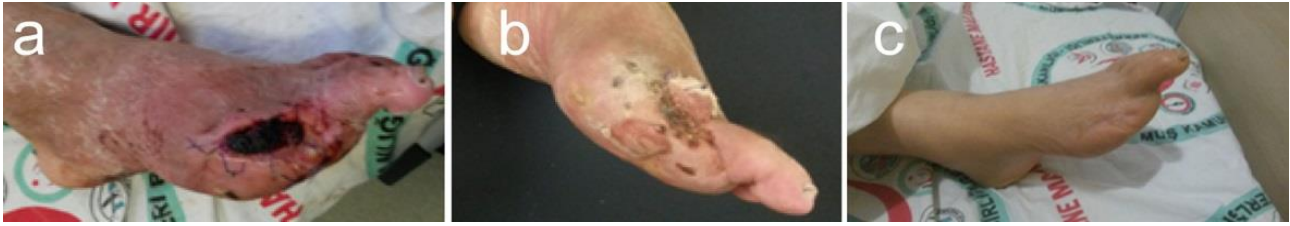
Fig. 3. A 68-year-old patient with uncontrolled type II diabetes (pt. 8) with an open wound occurring after disarticulation at metatarsophalangeal joint. Primary suture cut out occurred due to the patient being discordant with the treatment. The patient then underwent wound coverage by skin stretching with our technique and had perfect outcome at the end of 6 weeks with full weight bearing. Left, before surgery; right, six weeks after wound closure.