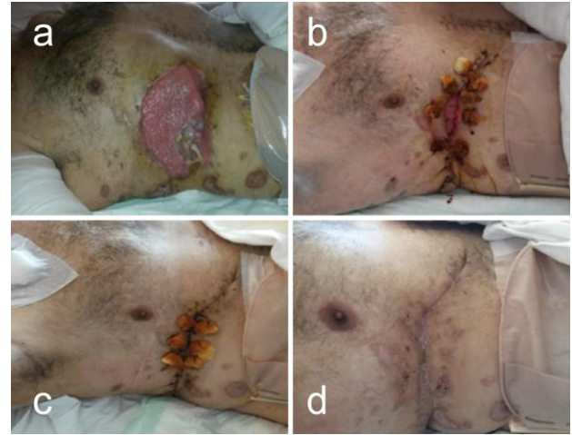
Fig. 2. A 44 -year-old patient (pt. 1) with multiple wounds from bomb blast injury. Figures show the staged closure of the wound at the right thorax sized 17x11 cm. Reapplication and tightening of the suture was performed after 2 weeks to close the rest of the skin gap. Sutures were removed on the twelfth day. The patient had perfect functional results at the end of 6 weeks. (a) before surgery, (b) partial closure using the technique, (c) complete closure at the second session, (d) six weeks after wound closure.

Collagen and elastin fibers are embedded and float in a gel-like base in the epidermis and dermis and comprise the majority of these layers (i.e. about 75% and 4% of the dry weight, respectively) [3]. The skin's ability to stretch and expand is largely imparted by the reorientation of this interwoven network of elastin and mainly collagen fibers [12]. Also, biomechanical properties of the skin, and particularly mechanical creep and stress relaxation, allow skin to stretch beyond its inherent