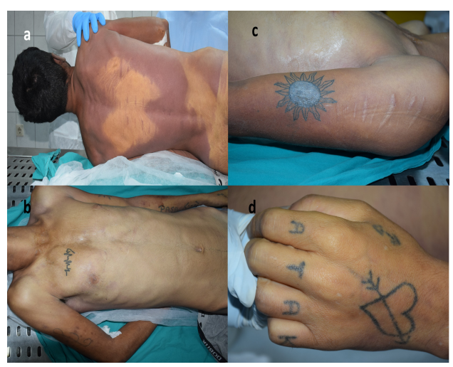
Figure 4. In the second case; a) light purple colored livor mortis b-d) tattoos and old incision marks on various parts of the body