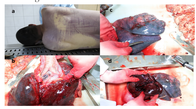
Figure 2. In the first case; a) dark purple colored livor mortis b-c) subpleural petechiae and swollen and edematous lungs, d) edematous and bleeding lung sections.

on the lips, auricles and nail beds, and livor mortis was demonstrated in the dark purple color. No other traumatic findings were observed on the body. Closed blood samples and samples from the lungs were taken at autopsy, subpleural petechiae were observed in the macroscopy of the organs, the lungs were swollen and edematous, lung sections were edematous and bleeding (Figure-2), and no other macroscopic features were found in other organs.