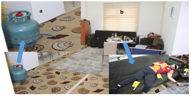
Figure 1. The room where the first case was found dead: a) a kitchen gas cylinder and hose with one end connected to the gas cylinder, b) general view of the room, c) corpse

Case 1: A 29-year-old male professional soldier was found dead on the sofa in his room on the top floor of a building used as a 4-storey dormitory. In the crime scene investigation accompanied with forensic medicine specialist, a kitchen gas cylinder was found 2.5 meters away from the corpse, with one end of the hose connected to the cylinder and the other end free in the room (Figure-1).