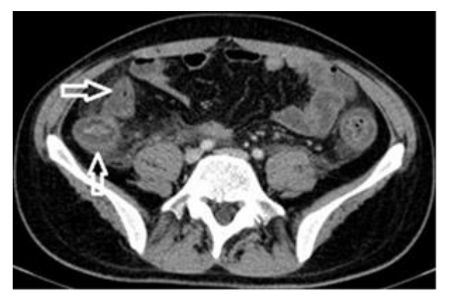
Fig. 2. Axial image shows wall thickening in the cecum (vertical arrow) and terminal ileum (horizontal arrow)

number of patients with additional left colon involvement, and here the number of exitus patients is 2. The total of C and D groups shows the number of patients with additional terminal ileum involvement, and here the number of exitus patients is 6. In other words, the mortality rate in patients with additional terminal ileum involvement is higher than in patients with additional left colon involvement. However, due to the small number of cases, this difference was not statistically significant (p=0.580).