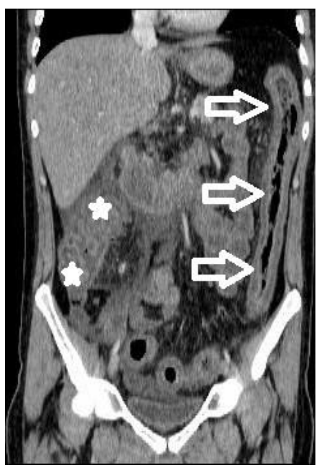
Fig. 3. Widespread thickening is observed in the ascending (stars) and descending colon (arrows) in coronal reformat image

clustered distended bowel loops in the right lower quadrant can be observed (8,15). Barium x-ray and colonoscopy are contraindicated due to the possible risk of perforation (7).