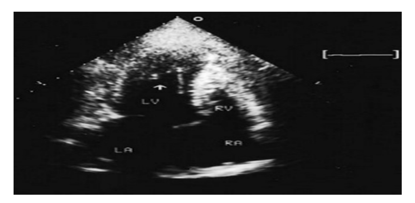
Figür 1. Left ventricle apical hypertrophy (arrow), and left atrial dilatation on the apical-4-chamber section of transthoracic echocardiography.

was asymptomatic and routine clinical evaluation was normal in the last examination three months ago.