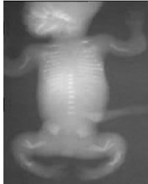
Figure 3. X-ray of aborted fetus

Prenatal diagnosis is especially important for malformations incompatible with postnatal life. Therefore, increase in rate of prenatal diagnosis of congenital malformations also results in increased pregnancy terminations (2).