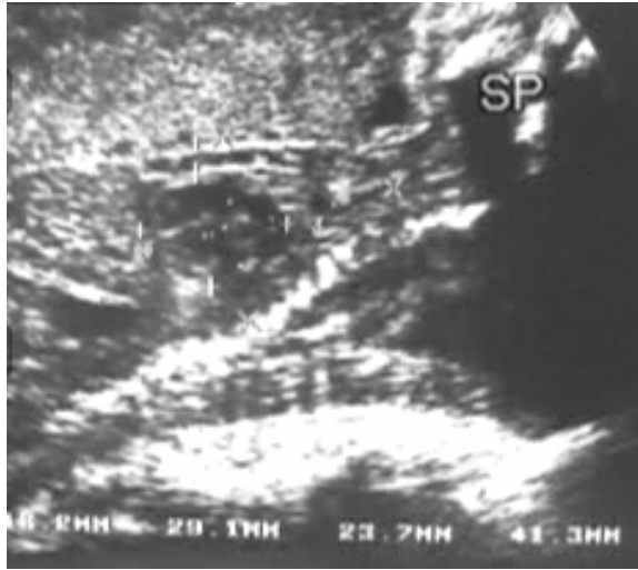
Figure 2. Pelvicaliectasia at right kidney