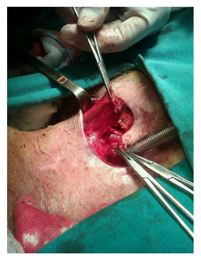
Fig. 1. Sternocleidomastoid muscle separation from medial adhesion site