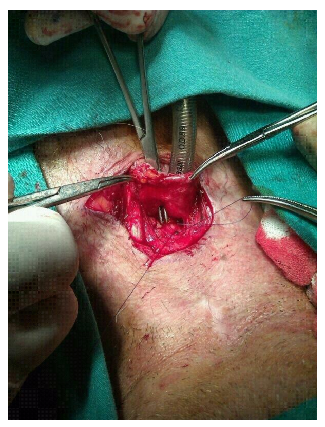
Fig. 2. Sternocleidomastoid muscle's transposition