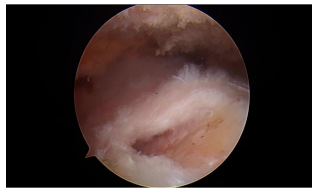
Figure 1: 59-year-old female patient. Preparation of the rotator cuff anatomical attachment site.

Surgical technique: All patients were treated by a single surgeon in the beach-chair position under general anesthesia. The nerve block was not applied to any of our patients. To control bleeding during the surgery, controlled hypotension was requested in consultation with the anesthesiologist, and adrenaline was added to the irrigation fluid. Bleeding control was achieved by keeping the arthroscopic pump at a pressure range of 70-90 mm-Hg. Four standard portals were used: anterior, posterior, accessory posterolateral and lateral portals. The glenohumeral joint was examined in all patients. Necessary interventions (tenotomy, tenodesis) were performed for biceps and labral pathologies. After glenohumeral joint examination, bursa debridement was performed by switching through the subacromial space, and limited acromioplasty was performed by loosening the coracoacromial ligament as a standard procedure. The anatomical attachment points of the rotator cuff were revitalized with shaver and burr, and this surgical procedure was combined with the microfracture method, making the tendon suitable for regeneration (Figure 1).