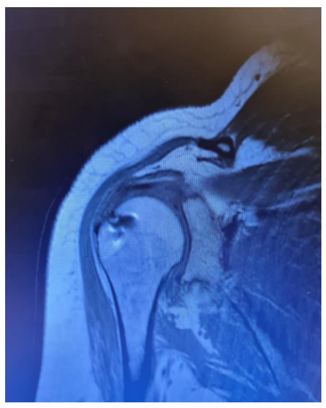
Figure 4: MRI section of the patient in the 2nd postoperative year. There is Sugaya type 1 recovery.

Statistical analysis: Data were analysed using the Statistical Package for Social Sciences, version 25.0 (SPSS Inc., Armonk, NY). The normality of numerical data distribution was examined using the Shapiro-Wilk normality test. Continuous variables that do not show normal distribution are presented as median and interquartile range (IQR; 25th-75th percentile) or minimum-maximum, and qualitative data are expressed as frequency and percentage. Wilcoxon signed-rank test was used to compare repetitive variables that did not have parametric distribution. A marginal homogeneity test was applied in the analysis of dependent categorical variables. Spearman correlation analysis examined the correlation between the functional visual analogue and shoulder assessment scales. The confidence interval is 95%, and the accepted margin of error is 5%. A value of P<0.05 was considered statistically significant.