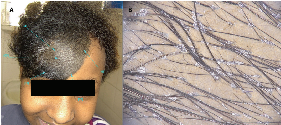
Figure 1. Fourteen years-old male patient, (A) congenital nevus on forehead, (B) dermatoscopic view, homogeneous diffuse brown pigmentation