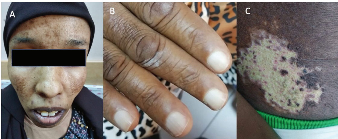
Figure 2. Dermatological findings of different patients, (A) facial acne and post-inflammatory hyperpigmentation, (B) leukonychia, (C) depigmented patch in the abdomen