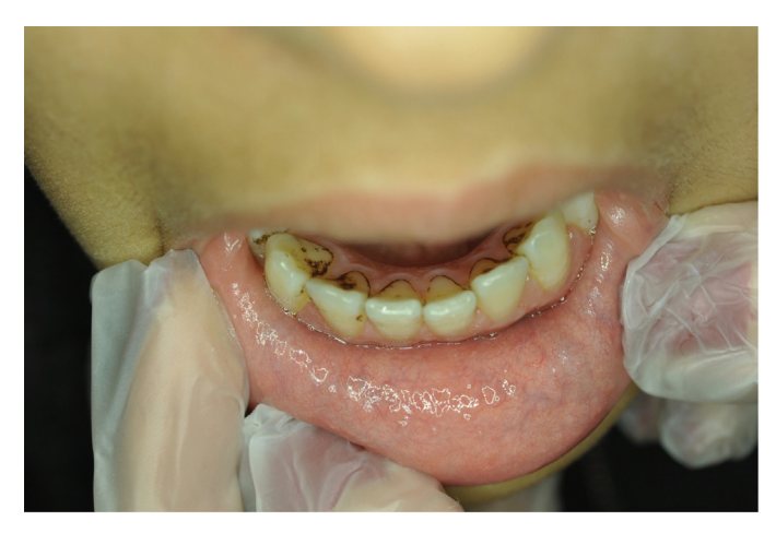
Figure 3. Pigmentation of the anterior teeth