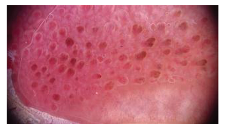
Figure 4. Dermoscopy showed both patterns