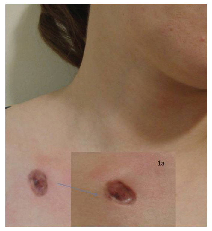
Figure 1. Close-up view of a soft, hyperpigmented, atrophic-appearing lesion (2x2 cm in diameter) with prominent depression of the skin in the right subclavicular region

A 38-year-old female patient presented to our outpatient clinic with the complaint of collapsed lesions that had formed spontaneously for 3 years in the anterior aspect of the trunk. Systemic examination of the patient, whose personal and family histories were unremarkable, was normal. Dermatological examination revealed an atrophic lesion with a diameter of 2x2 cm in the right clavicular region, with soft hyperpigmented marked depressions on the skin (Figure 1). In the histopathological examination of the skin biopsy taken from the lesion with atrophic scar, atrophic dermatofibroma, and morpheic basal cell carcinoma, there was a basket-weave orthokeratosis in the epidermis, epidermal hyperplasia, dermal atrophy, a thin intact grenz zone in the dermis, leaving a tummy-type fibrous tumor covering the entire dermis (Figure 2). In the immunochemical examination, intravascular staining was observed with CD34, but no staining was observed in neoplastic cells (Figure 3). No staining with factor XIIIa was observed. Dermoscopic examination could not be performed during the examination because of technical reasons. A diagnosis of atrophic dermatofibroma was made according to the clinical and histopathological findings. The patient was consulted with the plastic surgery department for the total excision of the lesion. Histopathological examination of the excision material also revealed findings compatible with dermatofibroma, and no lesion was observed within the surgical margins.