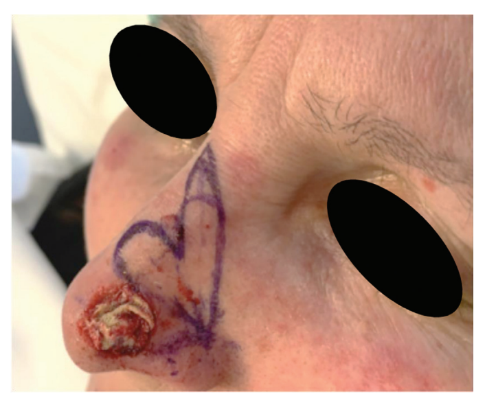
Figure 4. Tumor-free margins with 14x12 mm<sup>2</sup> surgical defect were achieved after the first stage of Mohs micrographic surgery. Repair with a laterally based bilobed flap was planned. Note the location of the pivot point and the incision line along the alar crease. The arc of total rotation, angle between the midline of the defect, and second lobe is a little wider than 90°