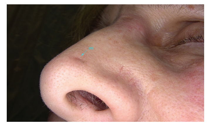
Figure 3. Basal cell carcinoma located on the lower one-third of the