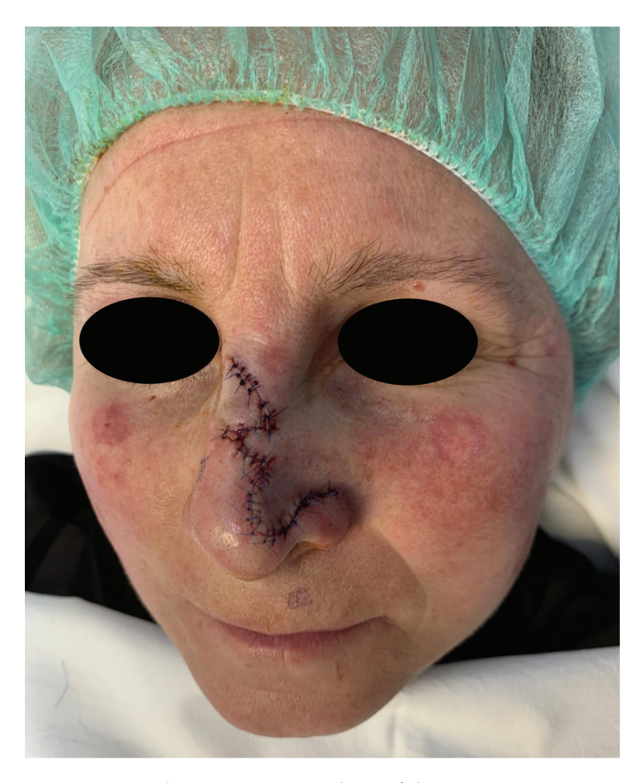
Figure 7. Immediate postoperative photo of the patient

Informed consent and permission for publication of the photos and medical data was taken from the patient.