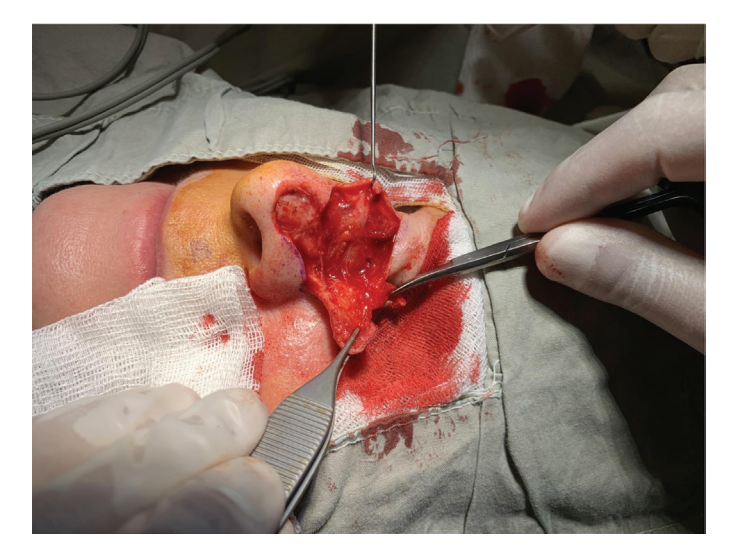
Figure 5. Intense undermining of the whole area including the flap, skin adjacent to the defect, and skin overlying the left nasal side wall