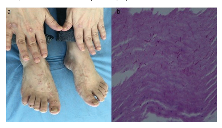
Figure 1. a) A psoriasis case presenting with onychomycosis in hand and foot nails, b) demonstration of fungal hyphae by the histopathological examination of the nail sample using periodic acid-Schiff stain

The data were collected by a physician in the relevant clinic, transferred to Microsoft Excel program, edited, cleaned, and made suitable for analysis. The Mann-Whitney U test, Spearman correlation and chi-