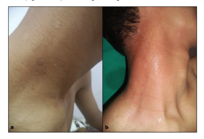
Figure 1. There are multiple well defined muddy brown hyperpigmented plaques with a dirty surface present over neck a) and b) immediate clearance of lesions after swabbing with cotton pads soaked in 70% isopropyl alcohol

A 20-year-old man presented with a 1 1/2-year history of asymptomatic brownish skin lesions over the chest and back. He had tried some "over the counter" topical medications but without any improvement in the skin lesions. His medical and dermatological history was unremarkable. His hygiene was good and was taking showers with soap and water at least 3-4 times per week. Dermatological examination showed multiple well defined muddy- brown hyperpigmented plaques with a dirty surface present over the upper chest near the root of neck and back (Figure 2 a,c) Skin scrapings for KOH examination didn't reveal any fungal component. With a suspicion of TFFD, swabbing with 70% isopropyl alcohol pads was performed that completely removed the lesions (Figure 2 b,d) confirming the diagnosis.