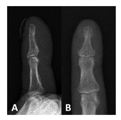
Figure 3. Radiography of the left fifth phalanx displays no bone involvement. (A) Lateral view. (B) Antero-posterior view