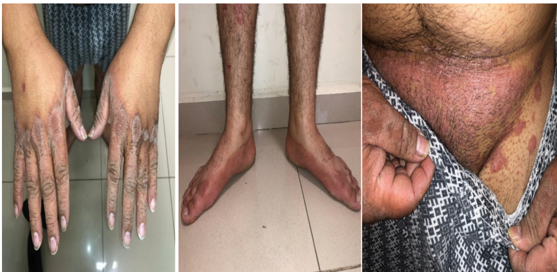
Figure 2. Hyperkeratosis protruding from the palmoplantar region to the lateral parts of the hand and foot. Erythematous squamous papule-plaques on the genital area with intact islets of skin between them