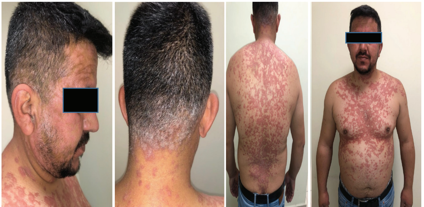
Figure 1. Erythematous squamous papule-plaques on the scalp, face, trunk, and shoulders with intact islets of skin between them

10.04 ( 10^9/L ), neutrophil: 55.2 ( 10^9/L ), aspartate aminotransferase: 25 U/L, alanine aminotransferase: 30 U/L, creatinine: 0.96 mg/dL, blood urea nitrogen: 18 mg/dL, anti-human immunodeficiency virus (anti-HIV) negative, and anti-hepatitis C virus negative. Tissue samples were taken from the patient for histopathological examination with prediagnoses of psoriasis and PRP. Histopathological manifestations were consistent with PRP, orthokeratosis, parakeratosis, prominent acanthosis, mild to moderate perivascular lymphocytic infiltration, and rare erythrocyte extravasation in the papillary dermis (Figure 3). Diagnosis of PRP was made with clinical and histopathological findings. We did not start with acitretin as the first-line treatment in