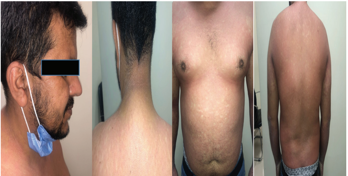
Figure 4. One month after starting adalimumab treatment

Six subtypes of PRP have been defined. The most common, type 1, is the classic adult type, and our case's symptoms matched this subtype. Infections, autoimmune diseases, and malignancies have been associated with PRP. For example, type 6 has been identified as a