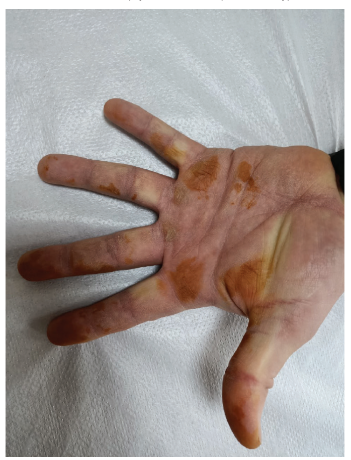
Figure 1. Dermatological examination (case 1). Well-demarcated, irregularly edged brown, hyperpigmented patches on hands

Laboratory test results were normal. The Wood examination was unremarkable. Exogenous pigmentation was ruled out because the patient denied history of contact with any substances, dye, henna, antiseptics, etc. A 4 mm punch biopsy was taken, and microscopic examination of the biopsy revealed compact orthohyperkeratosis