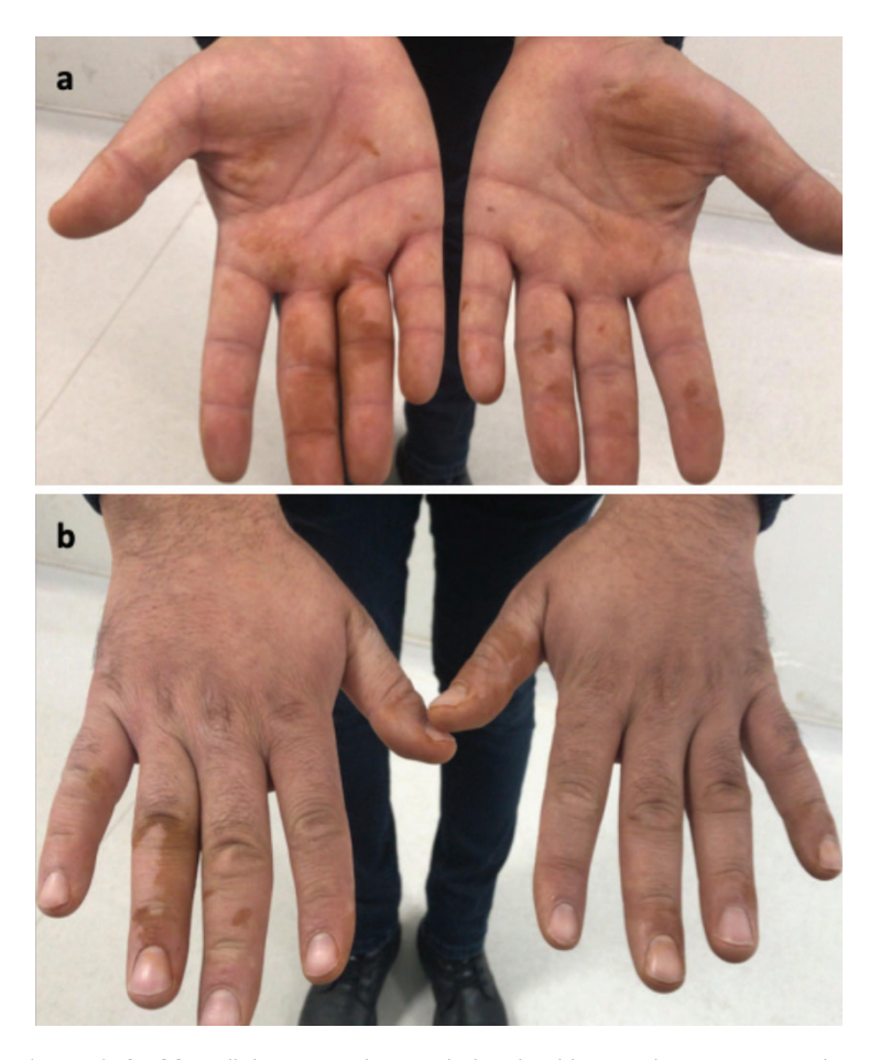
Figure 3. Dermatological examination (case 2). (a, b) Well-demarcated, irregularly edged brown, hyperpigmented patches on hands

cases with eccrine chromhidrosis in COVID-19. The cause of such a presentation, as in the present case, i.e., whether it is due to the drug used or to infection, is unknown. However, it may be caused by SARS-CoV-2 spike proteins in eccrine sweat glands.