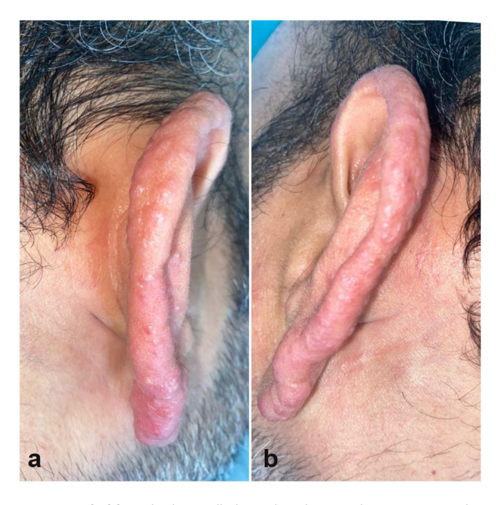
Figure 1. (a,b) Multiple small skin-colored to erythematous papules located on bilateral earlobes

In the literature, though there is mention of rupture of the epidermoid cyst as a trigger for LMDF, there are still only occasional reports of the coexistence of both. The present case presentation and histopathological picture of a ruptured infundibular cyst surrounded by epitheloid cell granuloma reprise the theory that, along with other factors, the rupture of the infundibular cysts may initiate an inflammatory cascade leading to the formation of granuloma in LMDF.