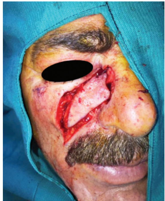
Figure 5. As seen in the picture, the whole surgical defect could have been restored fully with the island pedicle flap taken from the cheek. It would be an easy and less time-consuming procedure. However, repairing the nose unit with a flap from the cheek unit would have caused a bumpy scar and distortion of the normal anatomic appearance

For optimal cosmetic outcomes, incisions and suture lines must be placed along cosmetic unit junctions without crossing them. By this, surgical margins are hidden within natural borders, allowing scars to be imperceptible 4 . It is also very important to designate flaps within the limits of each cosmetic unit where the primary defect is, as it