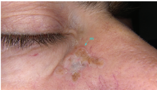
Figure 2. Basal cell carcinoma located on the right side of the face at the conjunction of three cosmetic units and subunits: the inferior eyelid (3b), the infraorbital cheek (4a) and the lateral wall of the nose (2b)