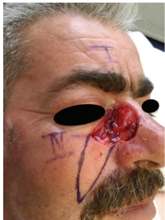
Figure 4. Outlined restoration plan of the surgical defect with an island pedicle flap. In order to optimize the final appearance of scar, incision lines were placed within the nasolabial fold and along the skin tension lines