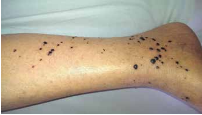
Figure 1. Multiple, black, sharply demarcated hemorrhagic blisters measuring 0.5-1 cm in diameter located on her ankles

diseases. Heparin-induced skin lesions located on the injection sites are one of the most frequent unwanted adverse effects 1 . Apart from the injection site reactions, bullous hemorrhagic dermatosis associated with heparin products occurring distant from the injection site has rarely been reported 2 . Our case was consistent with the previously reported 20 cases 3 in consideration of time of onset, clinical and histopathological appearance and resolution of the lesions. Especially, resolution of lesions despite continuing heparin treatment gives an impression of benign course, however, the mechanism of action remains unknown. We believe that one of the most critical concerns of this condition is the probability of development of similar hemorrhagic lesions in internal organs. Intracranial hemorrhage developed in our patient is not identical to heparin-induced thrombocytopenia after four weeks of treatment and with a platelet count of 110.000/mm 3 (previous value was 264.000/mm 3 ). Although the platelet count of 110.000 is not low, it is enough to be directly related to intracranial