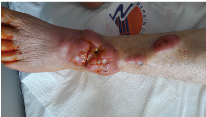
Figure 1. Three erythematous tumoral lesions on the anterior aspect of her left leg. The largest nodule was 7 cm in diameter and had an ulcer on top

ankle and extends to the dorsal foot. There are also smaller 2 nodules on the anterior aspect of her left lower leg that are 2 cm and 3, 5 cm in diameter. Constitutional symptoms such as, fever, night sweats, pruritus or weight loss was absent. Neither hepatosplenomegaly nor lymphadenopathy was detected in physical examination. All laboratory tests were negative, including a full blood count, biochemistry, routine urine examination, except hemoglobin (hemoglobin 11.2 g/dL, normal range: 11.7-16.1 g/dL) and creatinine levels (creatinine 1.89 mg/dL, normal range: 0.5-0.9 mg/dL). Serology tests for viruses (human immunodeficiency virus and hepatitis B and C viruses) were negative, except anti HBS-105.7 positive and anti immunoglobulin G (HBC IgG)-0.012 positive. In magnetic resonance imaging of the left lower leg, the tumor was found to extend to bone tissue, without bone infiltration. Histopathological sections showed superficial and deep dermal infiltration of atypical lymphoid cells with extensive irregular nuclear contour, partially vesicular nucleus, prominent nucleoli, narrow eosinophilic cytoplasm and frequent mitosis, causing focal ulceration in the epidermis (Figure 2). Immunohistochemically, these cells showed diffuse cytoplasmic staining with CD20 (Figure 3), BCL2. T lymphocyte markers were very sparse. The Ki67 proliferation index was detected as 70%.