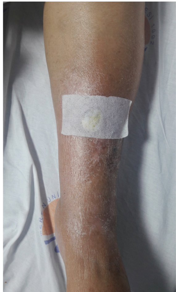
Figure 4. An ulcer emerged after regression of the tumor on upper part of leg. Other tumors healed with postlesional hyperpigmentation