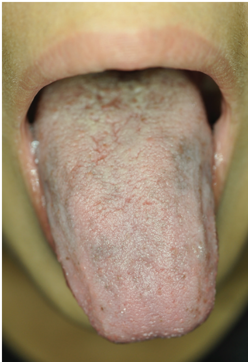
Figure 2. Gray-brown, patchy diffuse pigmentation in the middle part of the tongue