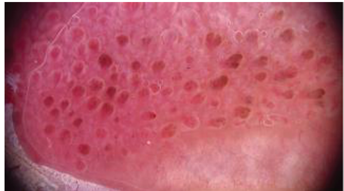
Figure 4. Dermoscopy showed both patterns