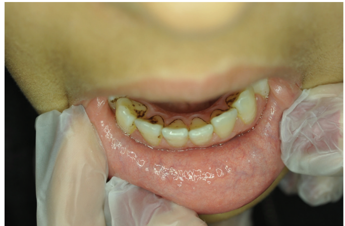
Figure 3. Pigmentation of the anterior teeth