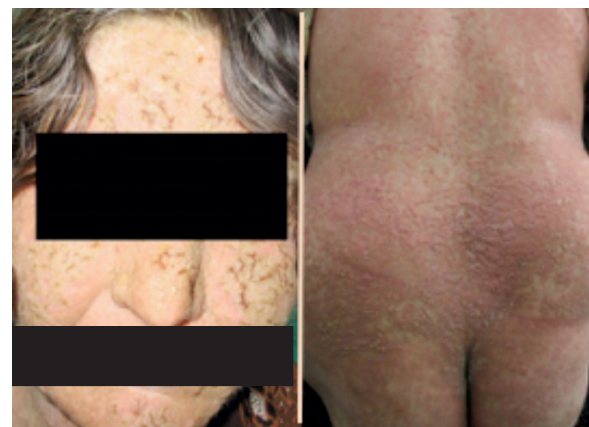
Figure 3. Common verrucous papules and plaques on the face and body, intense desquamation and fissures