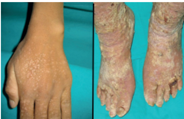
Figure 2. Acrokeratosis verruciformis-like lesions on the back of the hand and hyperkeratosis on the dorsum of the feet