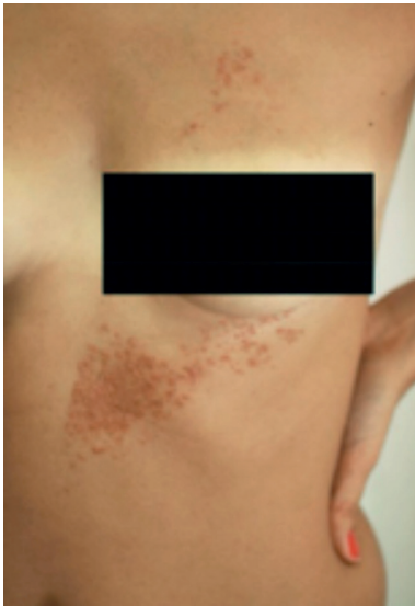
Figure 5. Pink millimetric papules with a fine scale starting from above and under the left breast (middle line), and extending to the back