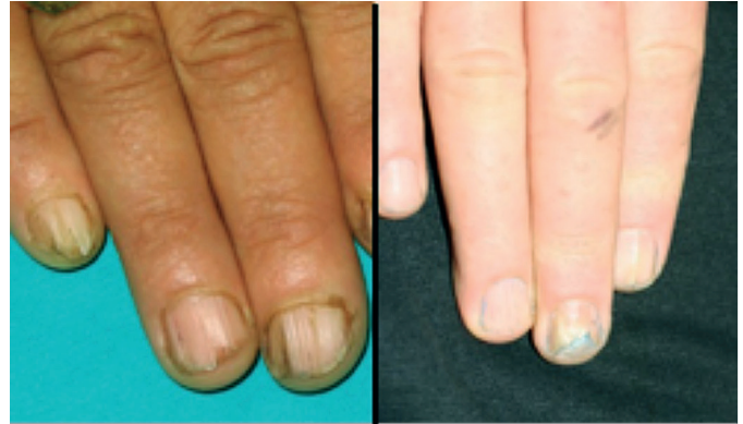
Figure 6. Longitudinal red-white lines in the nails and V-shaped notches and fissures in the distal of the nail

however, recurrence occurred with the termination of the treatment. Five patients with severe and diffuse Darier's disease were started on acitretin treatment, and there was a good response to treatment in 80% of these patients.