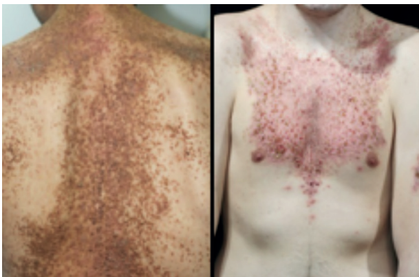
Figure 1. Keratotic papules, erythematous papules and brown crusted papules over seborrheic areas

Mental retardation was seen in 1 patient. Topical retinoid and steroid therapy was initiated in 4 patients, and their symptoms were reduced,