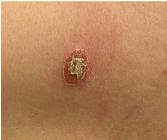
Figure 1. A 28-year-old female patient with a yellowish-white scaled erythematous plaque (1 cm diameter) on her left arm

Dermoscopy plays a remarkable role in appropriately diagnosing conditions of patients with misleading histories and clinical clues because of its ability to reveal findings not visible to the naked eye. Especially in pink solitary lesions, the technique is able to differentiate pink tumors from inflammatory, infectious, or autoimmune diseases 3-6 .