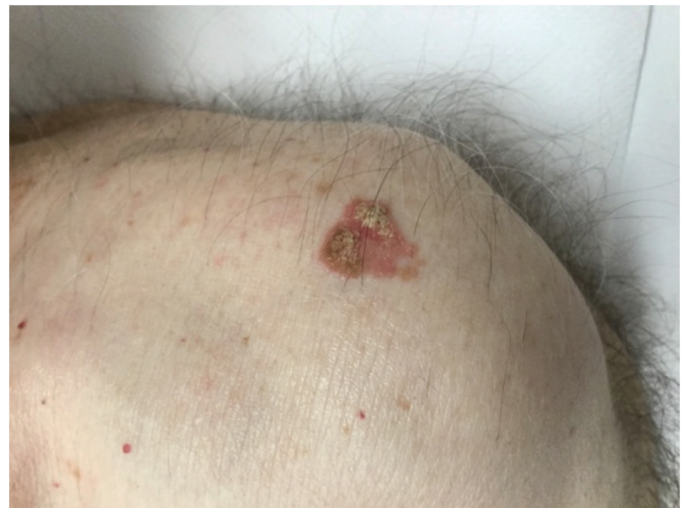
Figure 3. A 52-year-old male patient with a yellowish-white scaled erythematous plaque (1.5 cm diameter) with irregular borders on his left arm