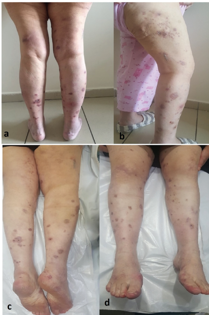
Figure 1. Multiple, erythematous-purplish, round nodular lesions with a diameter of 1.5-2.0 cm, were distributed along the anterior and posterior sides of both legs (a,b). Residual nodularity and post-inflammatory pigmentation at the end of the antibiotic treatment (c,d)

deflazacort and 300 mg/day of pyridostigmine bromide for MG and gliclazide and vildagliptin for diabetes mellitus. She did not have a fever or weight loss. Her systemic examination and chest radiography findings were normal. Inspection of the lower extremities showed multiple, non-tender, erythematous-purplish, round nodular lesions with a diameter of 1.5-2.0 cm spreading along the anterior and posterior sides of both legs and hips (Figure 1). She did not have any local trauma history and gardening activities. During the past month, she increased her MG drug doses to 90 and 420 mg/day for deflazacort and pyridostigmine, respectively, because of increased muscle weakness and overwhelming symptoms. Laboratory investigations showed no abnormalities on complete blood count, biochemical, and urine tests. Multiple punch biopsy and tuberculosis, fungal, and bacterial cultures from the skin were performed to consider atypical mycobacterial infections, sporotrichosis, erythema induratum, subcutaneous sarcoidosis, subcutaneous panniculitis-like T-cell lymphoma and primary cutaneous large B-cell lymphoma, and leg type in the differential diagnosis. Histopathology showed an inflammatory infiltrate in the upper dermis, micro abscess formation, and poorly formed granulomas, including Langhans giant