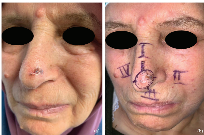
Figure 2. (a) Basal cell carcinoma located on the left nasal supratip. (b) Planning of the excision before Mohs micrographic surgery