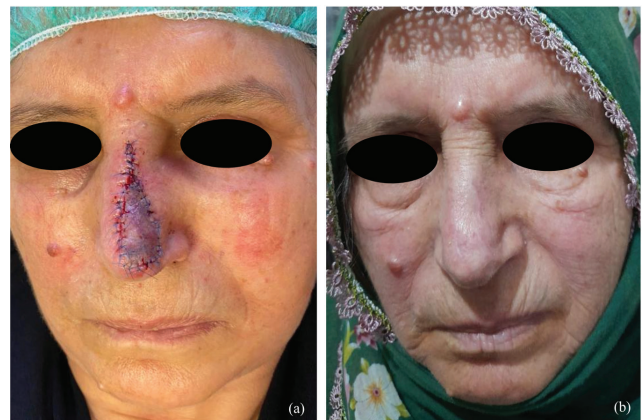
4. (a) View of the graft on the first postoperative day. Slight ecchymosis was noted on the graft area. (b) Gratifying cosmetic outcomes were observed on the grafted area in the 10 th month