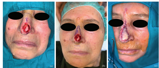
Figure 3. (a) Clear surgical margins were achieved after the first stage of Mohs micrographic surgery with a final surgical defect size of 17x15 mm. (b) Repair plan of the surgical defect with the Burrow's graft. (c) The postoperative appearance of the graft

Informed consent and permission were obtained from the patient for the publication of her photos and medical data.