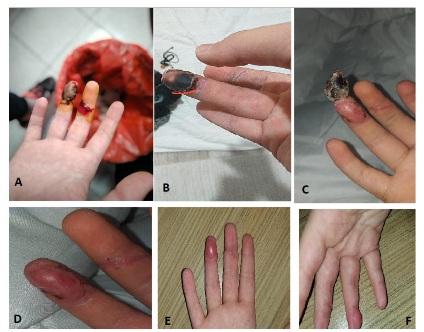
Figure 2. Healing steps in the repair and follow-up after zona III injury. (a) Composite graft repair after Zone III injury; (b) Day 7 image after repair; (c) Day 10 image after repair; (d) Day 14 image after repair; (e) Day 28 image after repair (anterior-posterior view); (f) Day 28 image after repair (lateral view)

The composite graft was preserved and cleaned in all cases. Four of the cases were admitted to the hospital after a cut, and one was seen as a result of a crush injury. Four cases were treated in the emergency department and one case was operated in the operating room. Necrosis was later observed in the patient who was performed in the operating room. This necrotic tissue was debrided at control examinations and allowed to heal secondarily. No complications were observed after the secondary intervention. Patients were completely satisfied in terms of comfort and esthetics. A median shortening of 3 mm (2–3 mm) was observed in the repaired fingers.