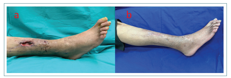
Figure 3. A wound on the middle 1/3 of the leg. The defect was repaired with a bipediculated flap prepared in the vertical plane. The donor area was primary repaired. (a) Pre-operative view of the patient. (b) Post-operative view of the patient at 14 months.