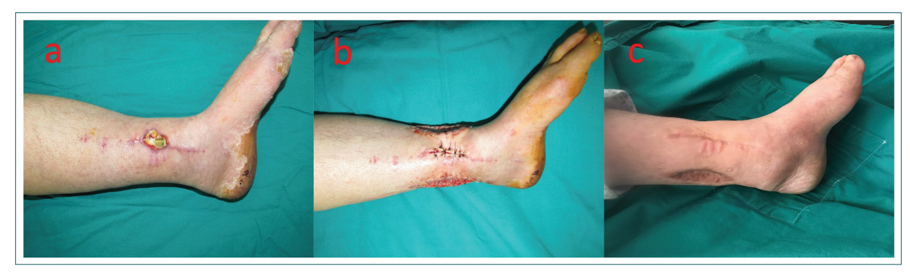
Figure 2. A wound on the distal 1/3 of the leg after another surgery. The defect was repaired with two bipediculated flaps prepared vertical plane, and the flap donor areas were repaired with split-thickness skin grafts. (a) Pre-operative view of the patient. (b) Early post-operative view of the patient. (c) Post-operative view of the patient at 12 months.