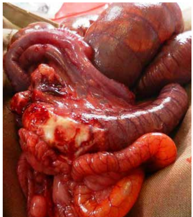
Figure 2. Macroscopic view of acute appendicitis. Fibrin plaques and perforation are seen at the proximal part.

SPSS software version 20.0 (SPSS, Inc., Chicago, IL, USA) was used for statistical analysis. Independent samples t-test was used for comparison of the groups. Statistical significance level was accepted as 0.05.