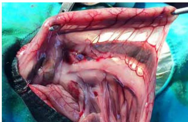
Figure 1. Normal appendix vermiformis, Clamp shows the area to be ligated.

At the end of the fifth day, all subjects underwent appendectomy under general anesthesia. Blood samples were collected for complete blood count and measurement of C-reactive protein (CRP) levels. During this second operation, macro-