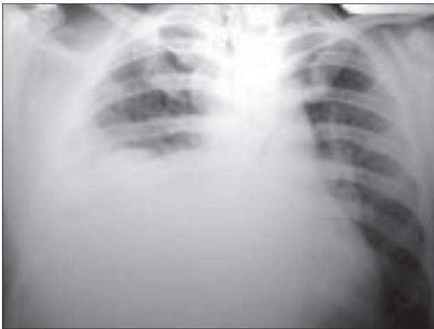
Fig. 1. Chest radiograph showing gross elevation of the right hemidiaphragm.

On admission, the patient had dyspnea and tachypnea (respiratory rate 30/minute) and saturation in room air was 92%. The clinical examination revealed no obvious external injury to the abdomen or thorax. The trachea was found to be in midline, and air entry was diminished in the right lower zone on auscultation. Repeat chest radiograph showed grossly elevated right hemidiaphragm (Fig. 1) compared to the chest radiograph taken immediately after the trauma, which showed only a slight elevation. Arterial blood analysis revealed respiratory alkalosis with mild hypoxemia. Differential diagnosis of hemothorax, pulmonary thromboembolism, pulmonary contusion, basal atelectasis, and collapse of the right lower lobe were considered. A computed tomographic (CT) scan was done, which showed discontinuity of the right diaphragm, presence of the liver in the right paracardiac