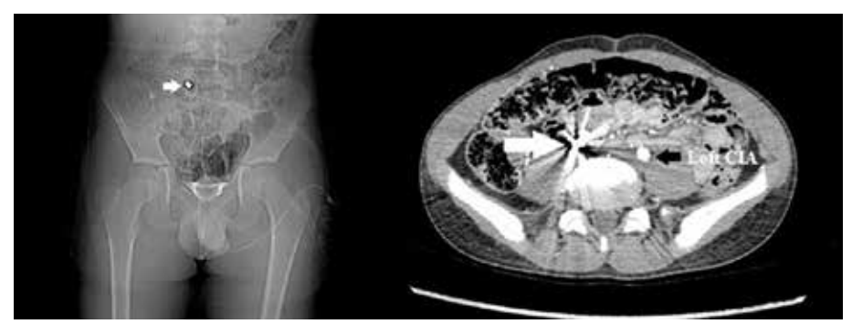
Figure 2. Chest radiograph with radiopacity (pellet) in the abdomen. Computed tomography showed migration of the pellet in the likely location of the right common iliac artery.

A right vertical groin incision was made, and the pellet was palpated in the common femoral artery. After preparing for incision, the pellet was removed from the femoral artery. The patient did well after surgery and was discharged on the fifth postoperative day.