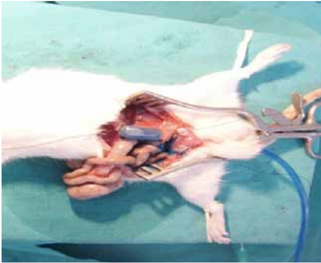
Fig. 2. Bursting pressure measurement.

(Color figures can be viewed in the online issue, which is available at www.tjtes.org )