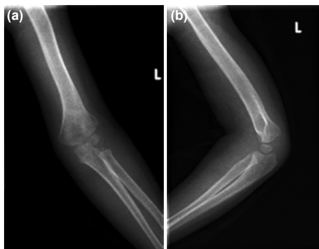
Figure 3. (a, b) Anteroposterior and lateral x-rays taken after pin extraction in the clinic at sixth week after surgery.

There were 36 Gartland type III fractures and 2 type II fractures in the study. No loss of reduction, pin migration, osteonecrosis, or nonunion was recorded. Superficial pin infection was noted in 3 patients: 2 patients in Group 1 and 1 patient in group 2, which were resolved with oral antibiotic treatment and saw no additional complication. All fractures healed uneventfully.