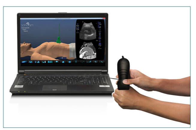
Figure 1. The SonoSim<sup>®</sup> Ultrasound Training Simulator.

The SonoSim<sup>®</sup> Ultrasound Training Simulator was used in this study. This simulator is made up of two pieces as a computer, including the software and the imaginary probe (Fig. 1). Imaginary patients formed by modeling the real USG images of normal or pathological patients are used in this simulator. The program includes 10 FAST cases consisting of a wide range of cases, from those with no free fluid to those with massive fluid. The trainee calibrates the probe according to its position on the imaginary patient on the monitor, and as he/she moves the probe, the USG image obtained from a real patient on the monitor moves correlated with the hand movements of the trainee. In this way, the trainee tries to catch the site to be visualized by moving the probe to the desired direction.