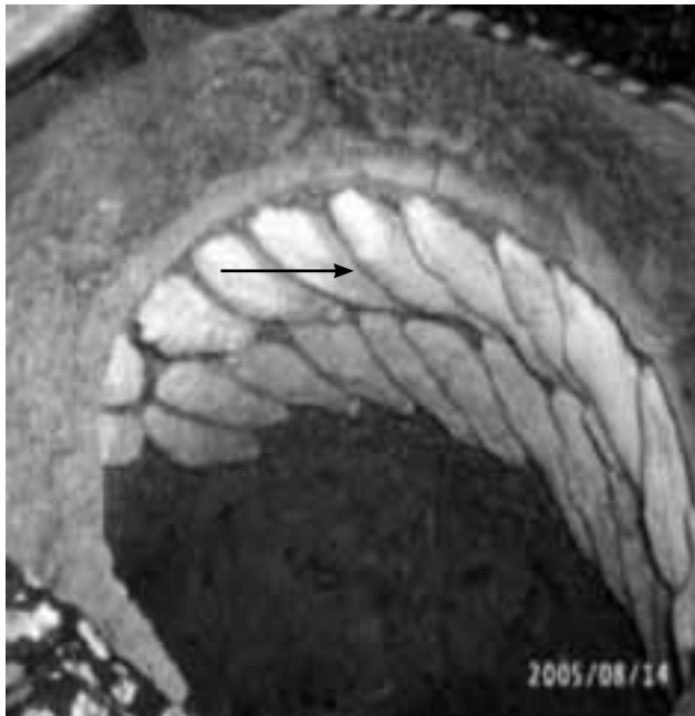
Fig. 1. Photograph of a tandir oven used for baking bread. The bread dough is pasted to the lateral walls (shown by arrow) and baked with the heat of the fire at the base of the tandir. The tandir can also be used like an oven to cook meals. The fire at the base of the tandir is generally ignited with firewood and used when it becomes an ember.

The Department of Emergency Medicine, Gaziantep University Faculty of Medicine, Hospital serves a local population of 2,500,000 people and treats approximately 65,000 patients each year. The Burn Center of our hospital was established in 2002, and has a 10-bed capacity. Local surgery intervention and every degree of resuscitation can be performed in this center. In this article, the records of the patients with tandir burn were reviewed with respect to age, gender, etiology and severity of the burn, type of treatment, hospitalization period, burn region, time of event, complications, morbidity, and mortality. A total of 981 burn patients (624 scald, 192 flame and 165 electric burns) were treated in this center from May 2003 to February 2006. Of those 981 patients, 21 (2.14%) patients had tandir burns.