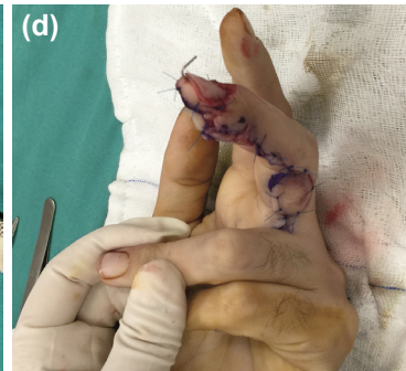
Figure 1. (a, b) Amputated part was prepared and fixed using Kirschner wire. (c) Flap was elevated. (d) Flap was sutured and donor area was closed using the skin of the amputated part.