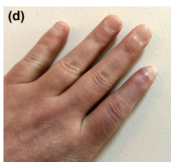
Figure 2. (a) Crush injury of the left index finger. (b-d) Postoperative result at the 8th month.