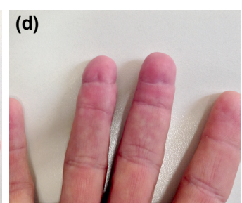
Figure 3. (a) Clean-cut injury of the patient's right middle and ring fingers. (b) Intra-operative photograph showing palmar vein anastomoses. (c.d) Postoperative good aesthetic results at the 15th month.

Patient 2: A 37-year-old man had a clean-cut injury of his left middle and ring fingers as a result of a work accident; the fingertip was amputated. Replantation was performed to the amputated middle and ring fingers. Palmar vein anastomoses was performed and all replantations were successful. The length of fingers was preserved at the postoperative 15<sup>th</sup> month (Fig. 3).