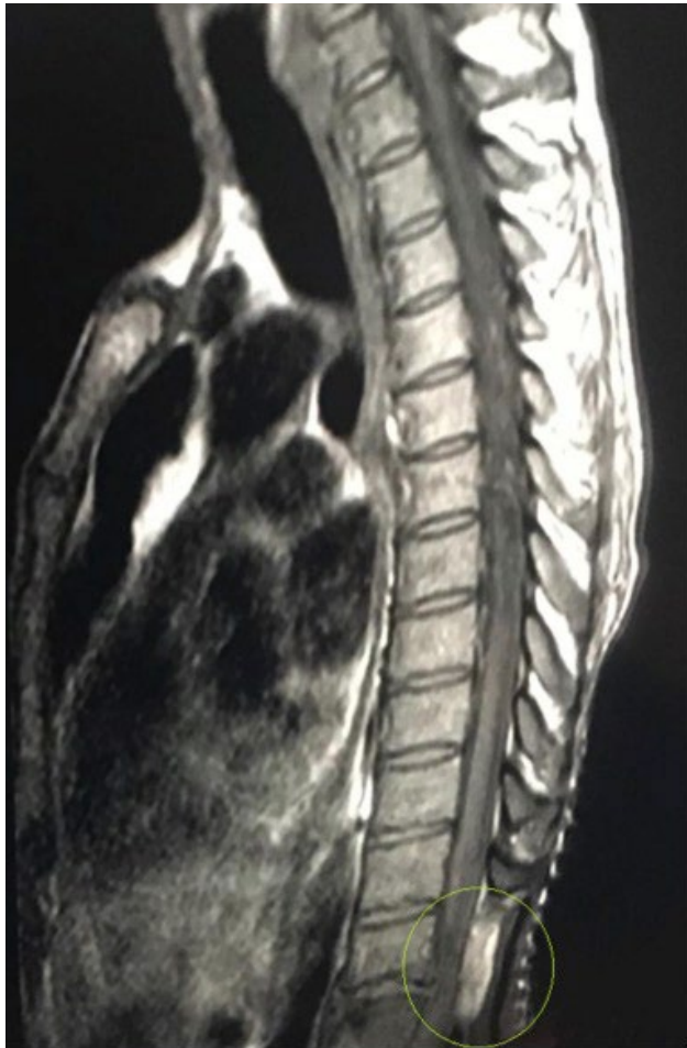
Figure 1. Lumbar abscess.

lumbar abscess, laminectomy at L1, and debridement of infected tissue. A new catheter was inserted into the lumbar spine by an experienced anesthesiologist familiar with the procedure. After the operation, the patient was admitted to the