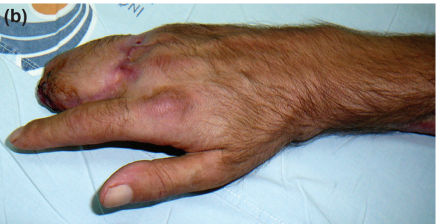
Figure 2. Late view showing the hand following the pedicle division (a) volar view (b) dorsal view.