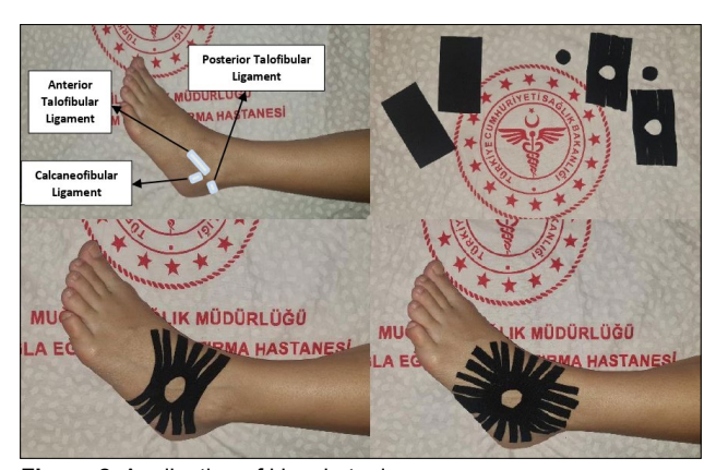
Figure 2. Application of kinesio taping.

The normality of the data distribution was assessed using the Kolmogorov-Smirnov test. Due to the absence of a normal distribution for all measured parameters, nonparametric statistical tests were employed. Continuous variables were