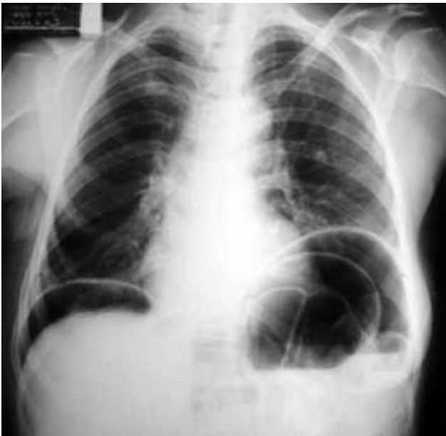
Fig. 1. Plain radiograph of the patient revealing bilateral sub-diaphragmatic free air.