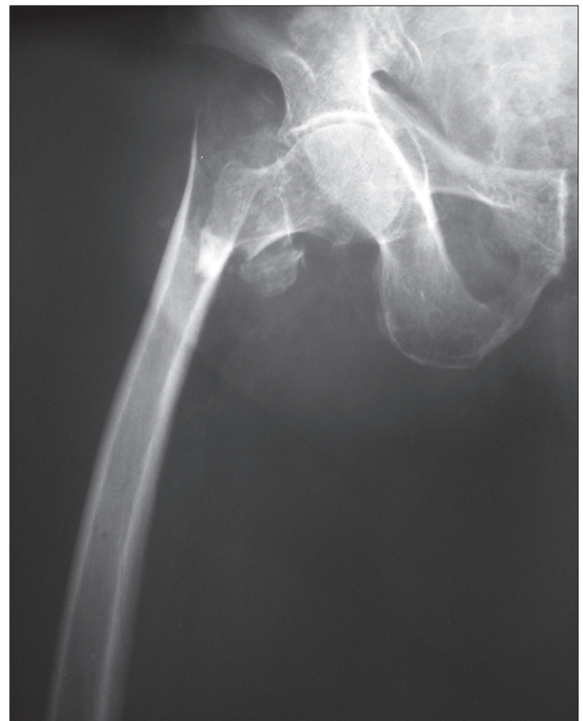
Fig. 1. Right hip unstable intertrochanteric fracture.

In all the cases, a longitudinal incision was made 3-4 cm from the proximal adductor tubercle, and a window was opened in the bone using the awl. The number of Ender nails (Ender type intramedullary nail; Hipokrat Inc., Izmir, Turkey) varied according to the width of the patient's femur medullary canal: 37 patients had two Ender nails inserted and 2 patients had 3 Ender nails inserted. Two or three Shanz pins were then applied to the femoral neck (Fig. 2). Unilateral external fixators (Hipofix Dynamic axial fixator;