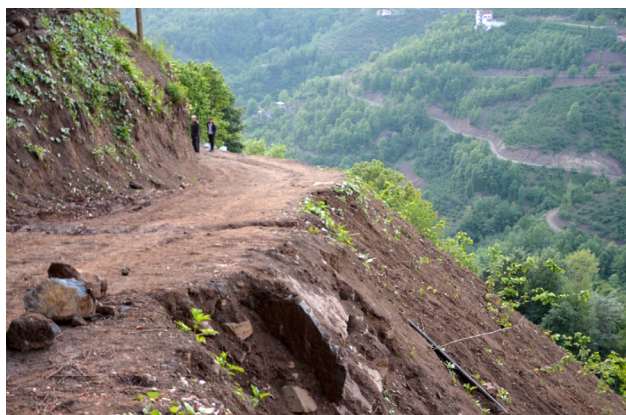
Figure 2. The steep unmade roads in the fields and rural areas in the region (real accident scene image).

it has become necessary to use patpats in relatively small agricultural areas because of the mountainous, rugged features of the land and the rainy climate (Fig. 2). Due to the geographical features of the region and the use of patpats other than for agricultural activities, the likelihood of accidents increases. The previous studies in literature have reported injuries and deaths as a result of patpat accidents. [2,5]