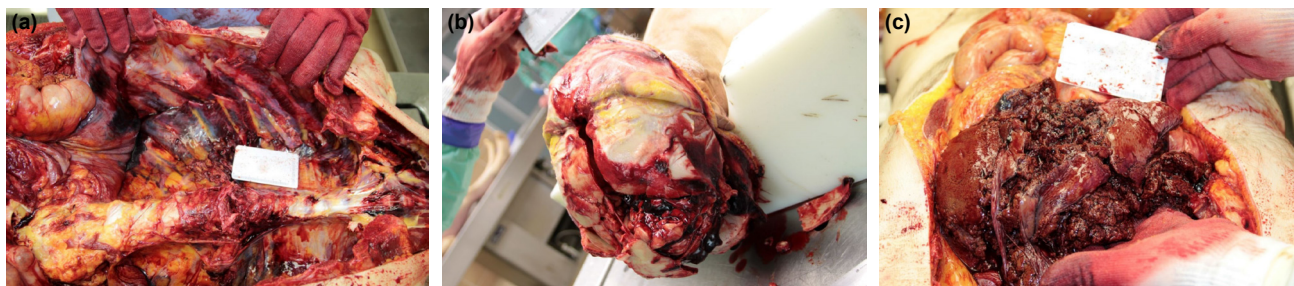
Figure 7. (a) Multiple costa fracture after severe blunt trauma and displaced thoracic vertebral fracture causing complete rupture in the medulla spinalis. (b) Diffuse intracerebral hemorrhage, contusion and laceration, and discrete fragmented skull fracture. (c) Widespread laser appearance in the liver.

In literature, it has been reported that the vast majority of tractor accidents occur in the fields and a lesser number on village roads and main roads between towns. [8,11] In addition to the use of patpats as agricultural vehicles, it can also be seen that they are frequently used as transport. In the Black Sea Region where this study was conducted, there is an ex-