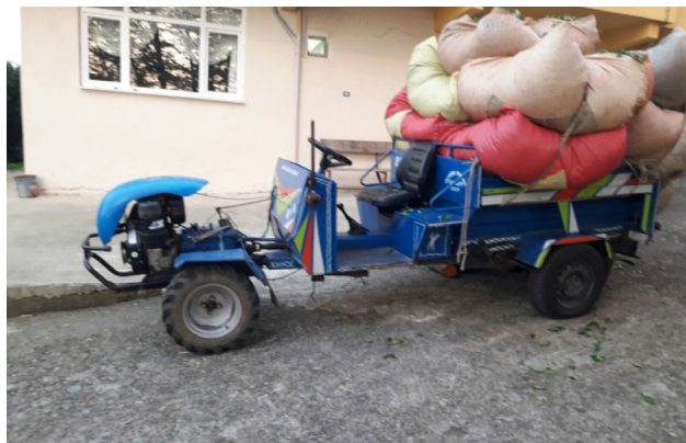
Figure 1. An example of a patpat used for carrying loads.

When patpats are used appropriate to the production purposes, technical properties, and laws, they are useful agricultural vehicles for villagers. They are widely used in West Anatolia on flat land. However, in the East Black Sea Region,