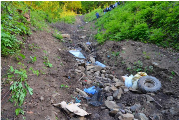
Figure 4. A patpat that breaks into a large number of pieces due to rolling over the abyss.