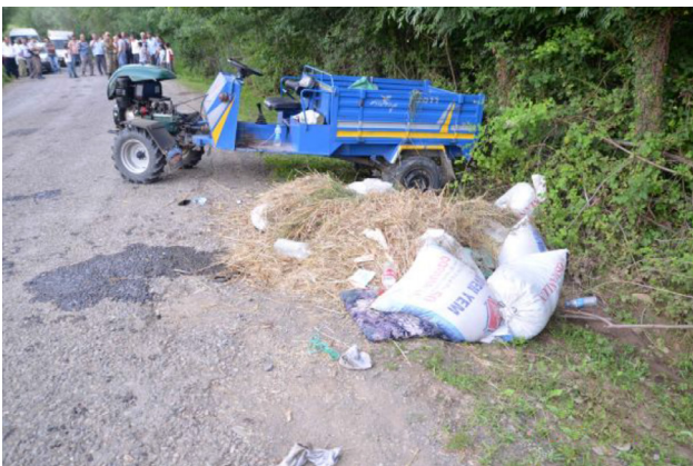
Figure 5. A patpat that has been knocked over because of roll over.

of a patpat accident. The 21 cases comprised 17 (81%) males and 4 (19%) females, with a mean age of 47.6 \pm 20.3 years (median: 57, range: 10–75 years). Of the total accidents, in 85.7% (n=18), no other vehicle was involved. The times of the accidents are shown in Fig. 3.