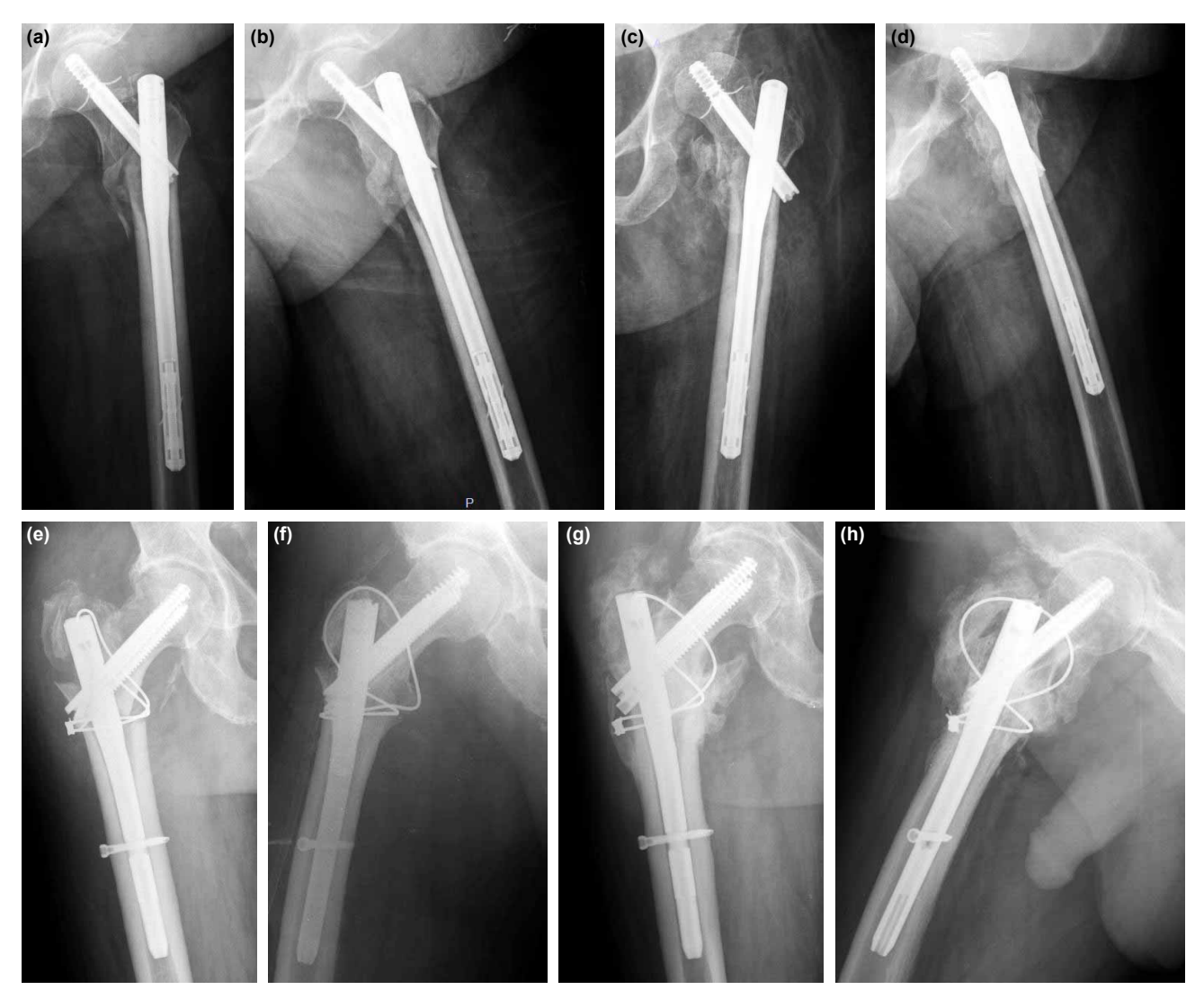
Figure 2. (a, b) Postoperative anteroposterior and lateral hip X-ray of a patient operated on with TDFN. (c, d) Anteroposterior and lateral X-ray of the patient at the 6<sup>th</sup> postoperative month. (e, f) Postoperative anteroposterior and lateral hip X-ray of a patient operated on with IT. The trochanter major fracture appears due to nail design. (g, h) Anteroposterior and lateral X-ray of the patient at the 10<sup>th</sup> postoperative month.

Descriptive statistics; mean and standard deviation or median, min-max values for continuous variables specified by measurement; frequency and percentage values are given for qualitative variables. The suitability of continuous data for normal distribution was evaluated by the Kolmogorov-Smirnov test. In group comparisons, for continuous variables, the significance test of the difference between the two means or