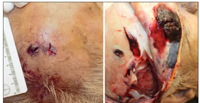
Figure 2. Frontal region defects of skin and bone due to shotgun pellet injury.

During the radiological examinations performed before the autopsy and at the autopsy, bullets were retrieved in eight cases. For evidence security, the bullet cores were duly removed from the body, numbered, photographed, and placed in evidence bags. In one case, no firearm residue was recovered, although many pellets were found at the scene (Fig. 2).