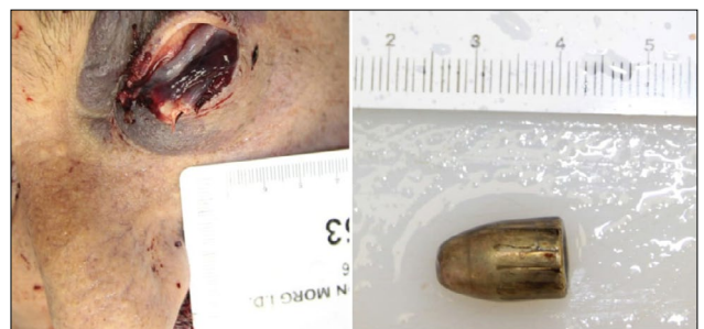
Figure 3. Bullet entry wound in the left eye with the bullet recovered from the corpse.

Bullet entry lesions were identified in various locations: three in the right parietal, two in the left parietal, one in the right frontal, one in the left frontal, one in the left eye (Fig. 3), and one in the right inguinal region. The bullet trajectories were observed to be horizontal from top to bottom in eight cases and from front to back in one case. The causes of death were identified as femoral artery-vein injury in one case and skull bone fractures, brain tissue damage, and brain hemorrhage in eight cases. Autopsy skin findings indicated that all injuries were caused by long-distance shooting. No toxic substances were found in the toxicological examinations of the cases. Among the perpetrators, five were under investigation and had not yet been identified, one as identified as a father, one as a friend, one as a neighbor, and one as a relative (Table 2).