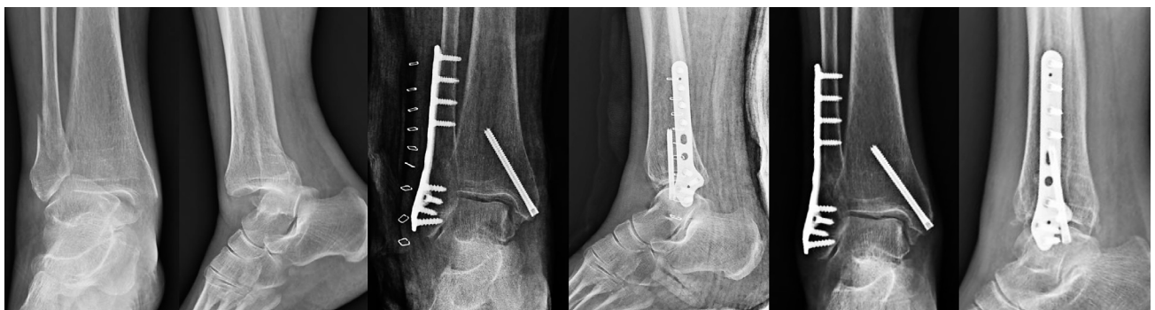
Figure 2. SER type 4 injury treated without trans-syndesmotom fixation. Views include pre-operative, early post-operative, and late post-operative.