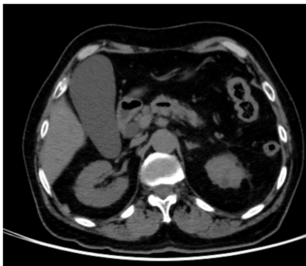
Figure 1. Acalculous acute cholecystitis. A 79-year-old male patient was admitted to the emergency department with the right upper quadrant pain. Contrast-enhanced computed tomography shows hydrops in the gallbladder and an increase in the gallbladder wall thickness (arrows). A single session percutaneous gallbladder aspiration was performed. Two days later, the patient was discharged

No significant difference was detected between the PA and