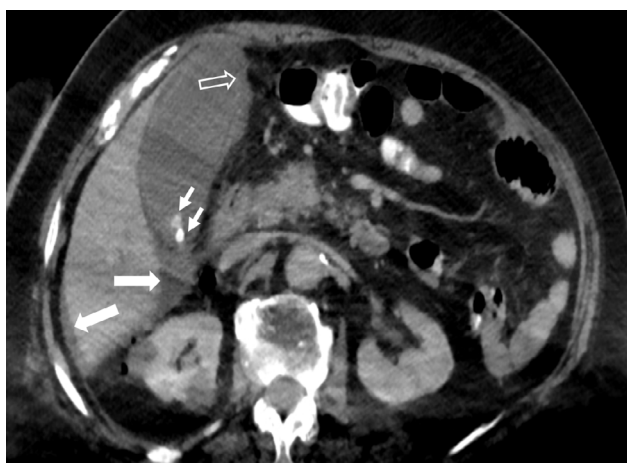
Figure 2. Calculus acute cholecystitis. An 84-year-old male patient. He was admitted to the emergency department due to chills, shivering, and abdominal pain that had started 2 days ago. Contrast-enhanced computed tomography shows hydrops in the gallbladder. Millimetric hyperdense structures representing stones (small arrows) are seen at the level of the gallbladder neck. Irregularities in the wall, especially at the level of the fundus of the gallbladder, are striking (hollow arrow). A small amount of fluid (large arrows) is noted in the pericholecystic and perihepatic areas. Percutaneous gallbladder drainage was performed. The patient, who developed low saturation during the follow-up, was admitted to the intensive care unit. She was discharged after staying in the intensive care unit for 4 days

ment, but only one was performed 2 times and a complete recovery was observed (4.5%). Since CRP continued to rise again after 72 h in four patients, they were switched to PC after PA (18.2%).