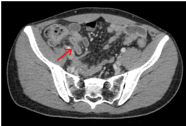
Figure 1. The computerized tomography of the patient consistent with acute appendicitis. The signs observed in this patient include an increased appendix diameter of 9 mm, wall thickening, and edema of the appendix wall. Lymphadenopathy surrounding this region was also observed.